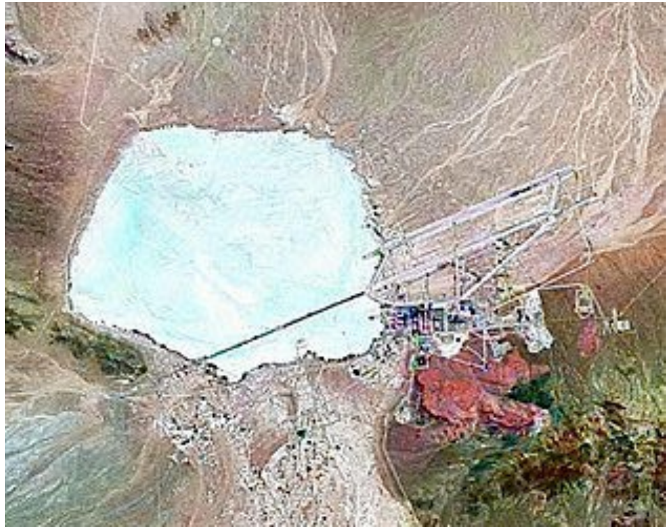
Satellite photo of Area 51