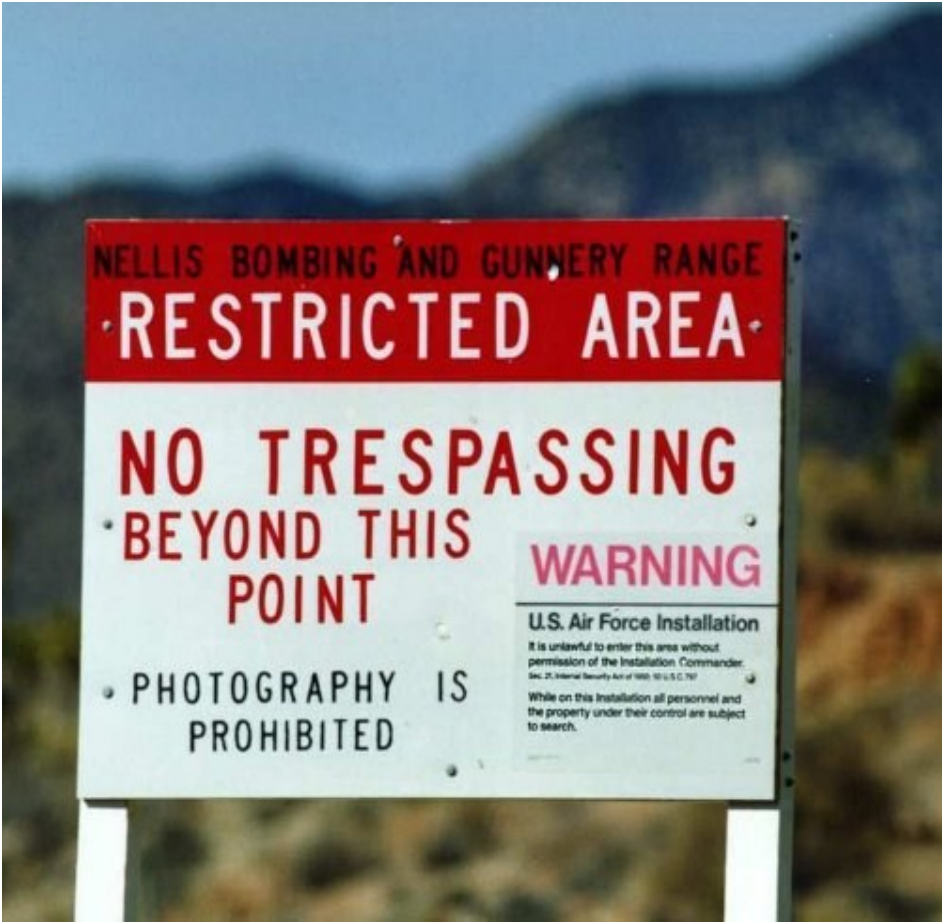
One of many signs around “Nellis Bombing Range”